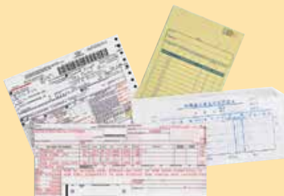
Fragile and thin documents Rice Paper • Airbills • NCR Forms

Ngenuity Scanners handle the widest range of documents of any scanner in their class,* from rice paper and air bills to card stock and long EKG strips. Streamline your document workflows and maintain image quality with ease.